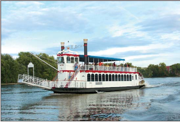
La Crosse Queen